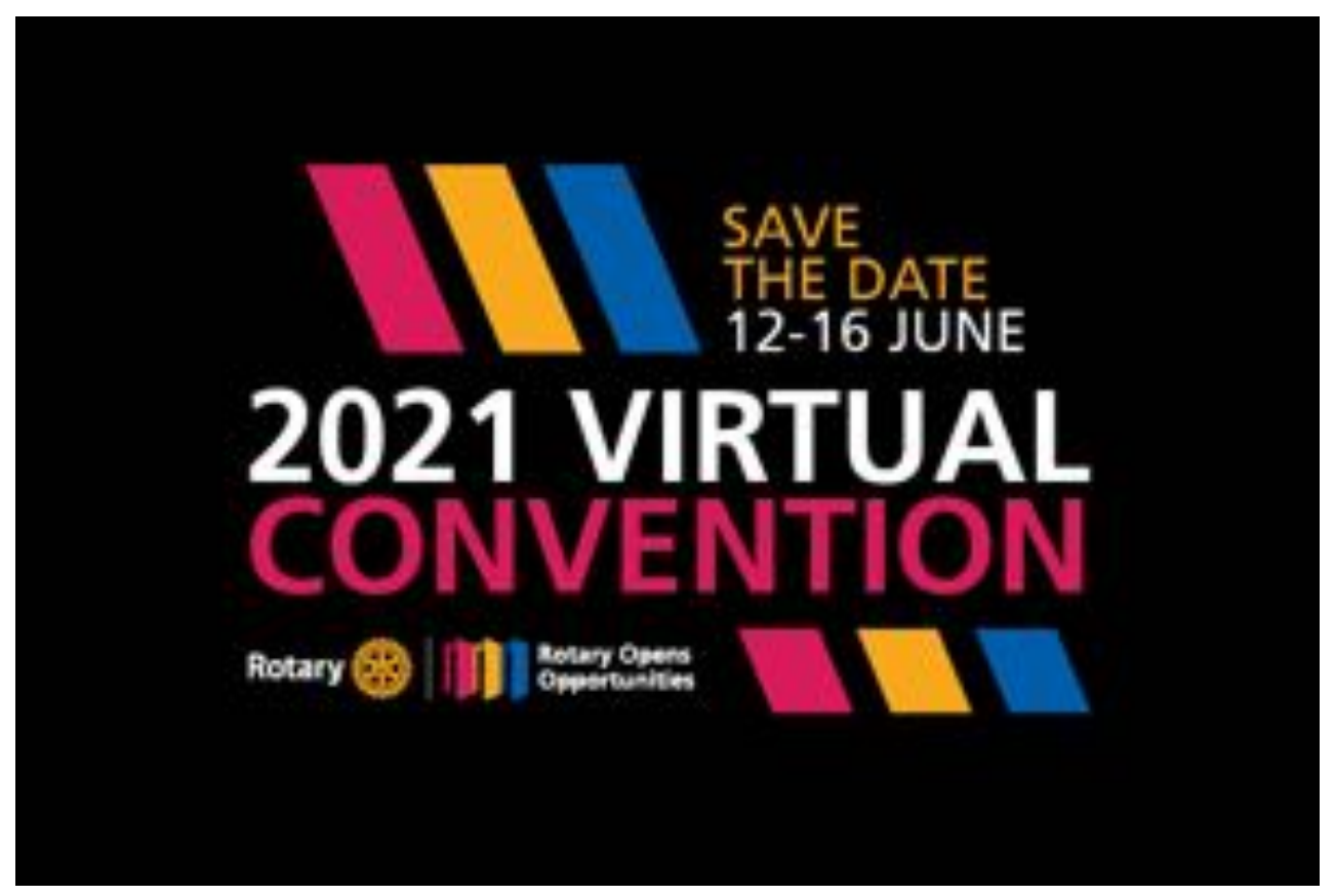
Rotary Opens Opportunities

Registration is open! Don't miss your chance to connect with Rotary members at the <u>2021 Virtual Convention: Rotary Opens Opportunities</u> which will take place from 12 through 16 June 2021.